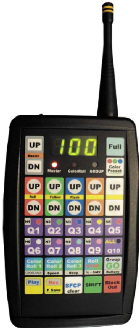
PX5-T10 RGBAW Controls